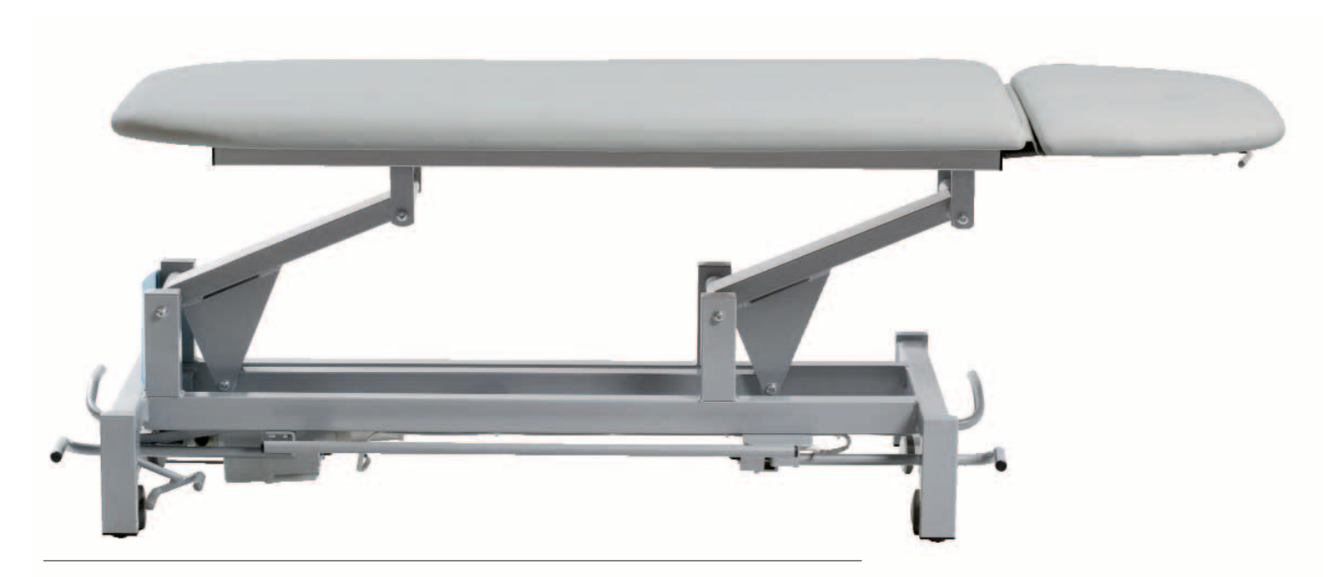
The image shows the Xtension Basic with all-round control bar option

Treatment table with 2-part lying surface Upholstery color Amalfi oyster