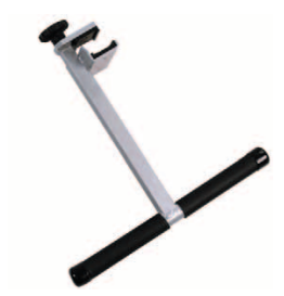
Height-adjustable T-bar Art. No. 10008663