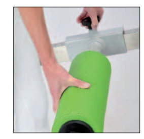
Backrest and seat adjustment