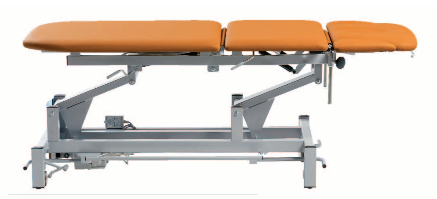
The image shows the Xtension Classic with the options: 3-part head section and all-round control bar