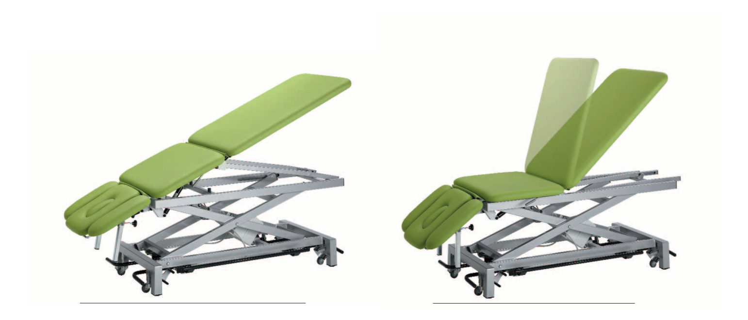
Upholstery color Amalfi apfel