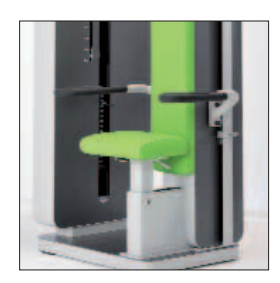
Position for dips exercise