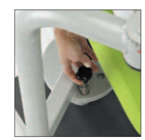
Selection of the start position