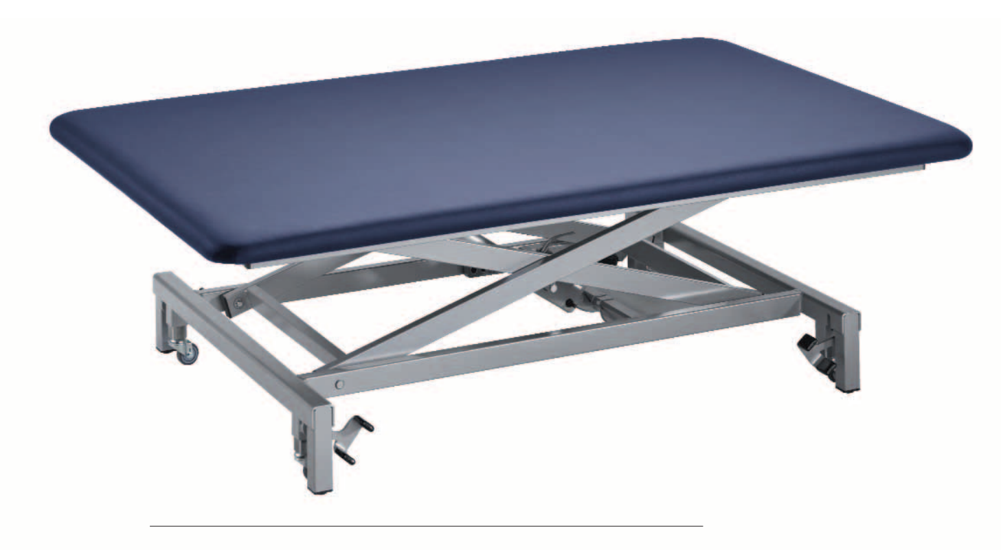
The scissor frame means that the height of the therapy table can be adjusted with no lateral offset.