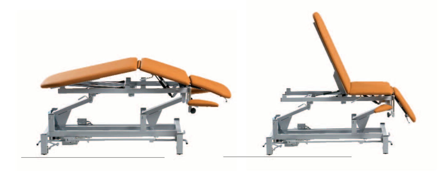
Treatment table with 3-pary lying surface Upholstery color Amalfi safran