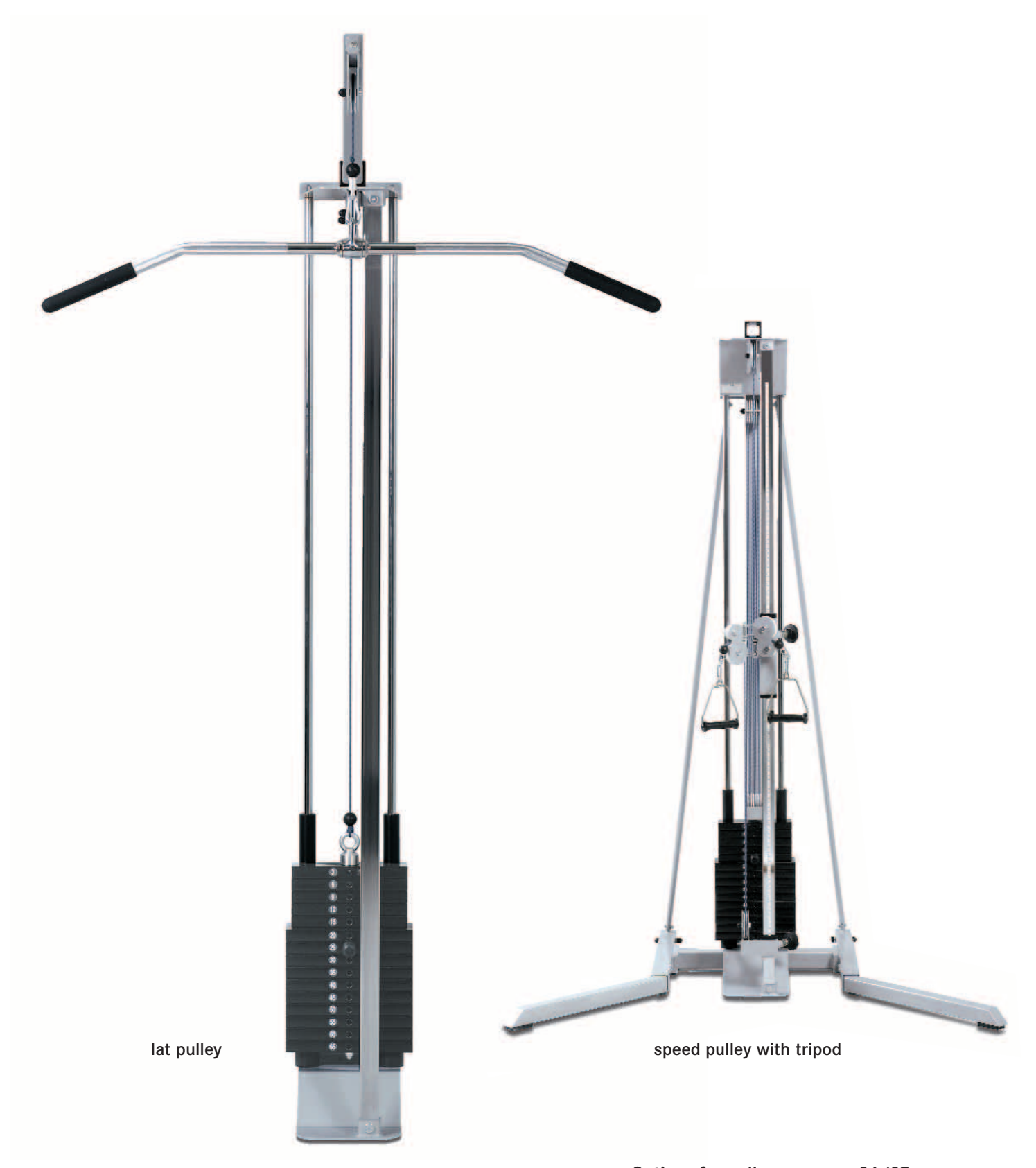
Options for pulleys on page 26/27.

Solid concrete or brick wall! Delivered without mounting hardware.