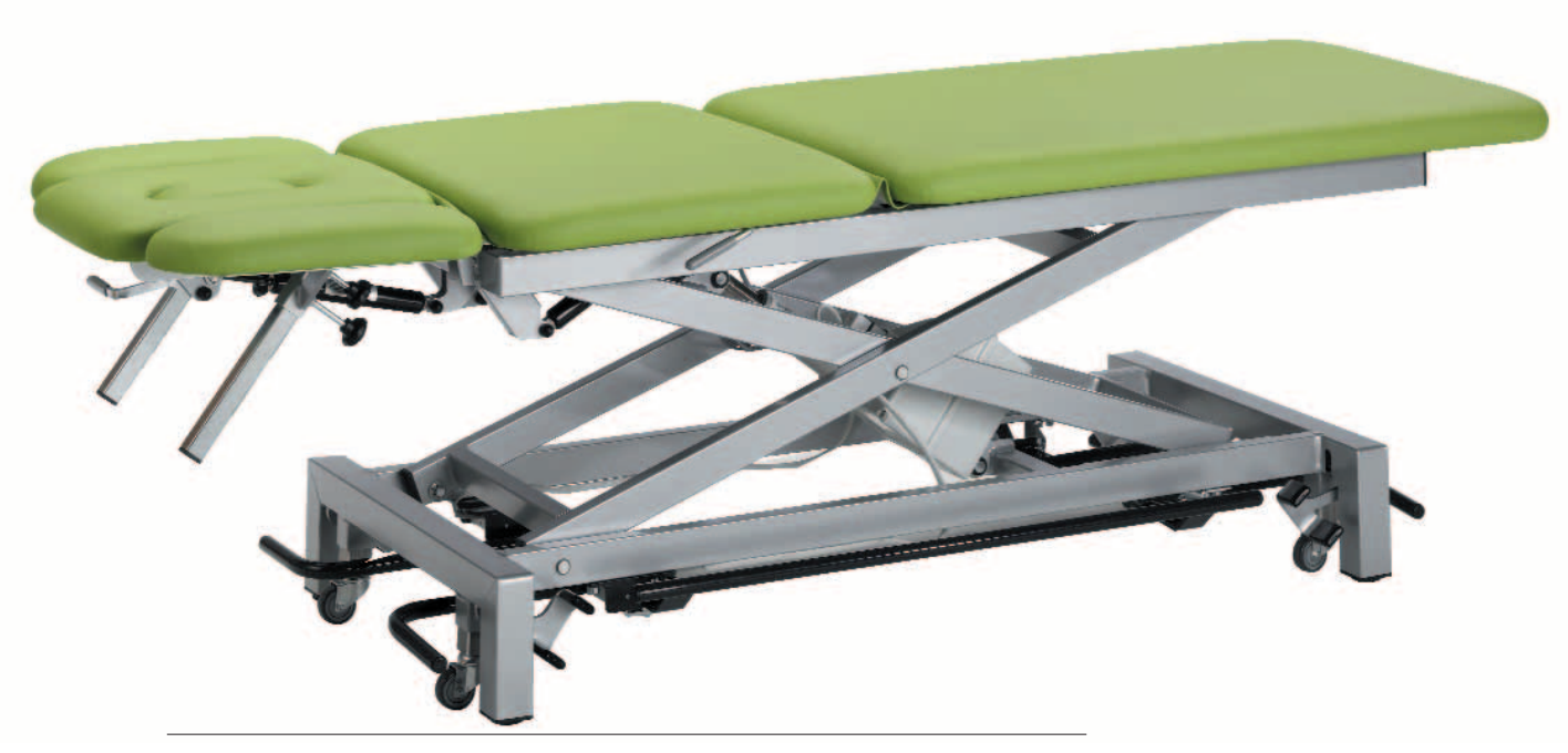
The image shows the Aruba 3P with an inox silver frame and the options: All-round control bar, turbo engine and 3-piece head section