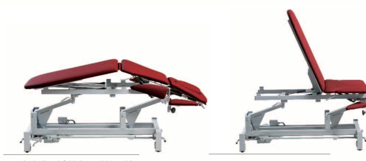
including 2 fold-down side cushions