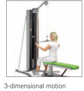
Options for pulleys on page 26/27.