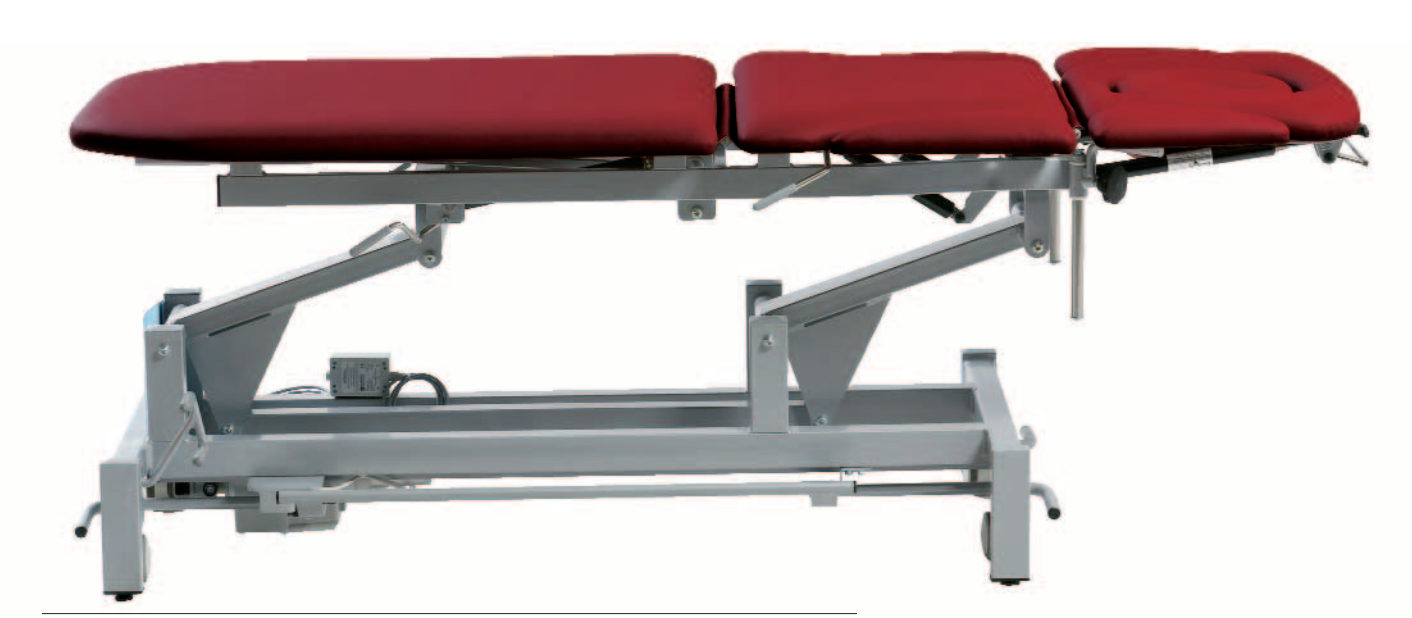
The image shows the Xtension Comfort with the options: All-round control bar and comfortably padded turning head section