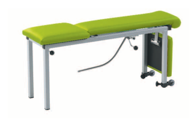
EQUIPMENT SIZE: (L \times B \times H): 154 \times 56 \times 78 cm TOTAL WEIGHT: approx. 60 kg

EQUIPMENT SIZE: (L x B x H): 124 x 48 x 55 cm TOTAL WEIGHT: approx. 50 kg