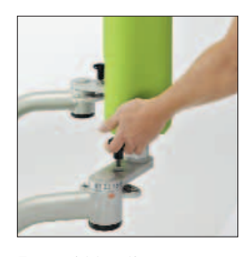
Easy width adjustment